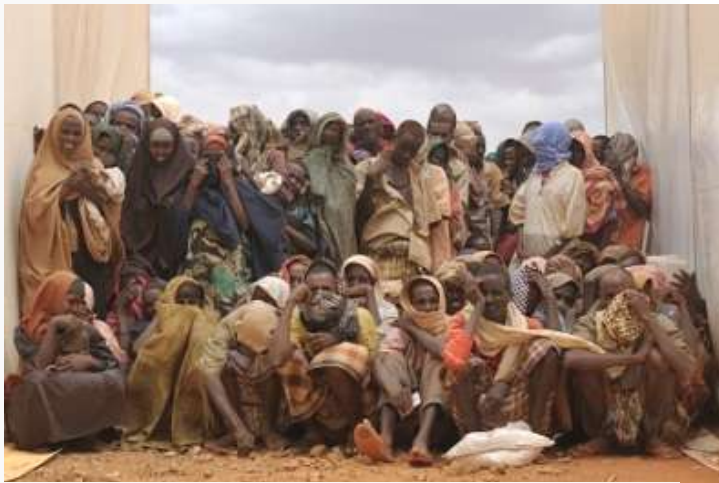
Somali refugees who recently crossed from Somalia into southern Ethiopia cluster between two food tents as they wait to be called to collect rations at the Kobe refugee camp on July 19, 2011.